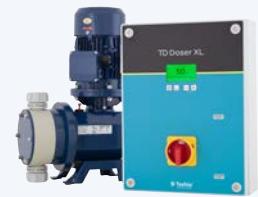
XL TD Doser