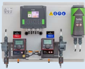
In-Line Dioxer Pro