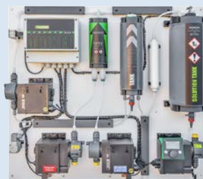
Batch Dioxer Pro