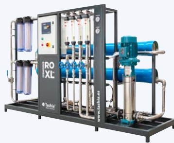
OMI RO XL