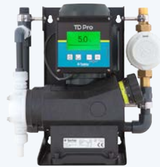
TD PRO SK